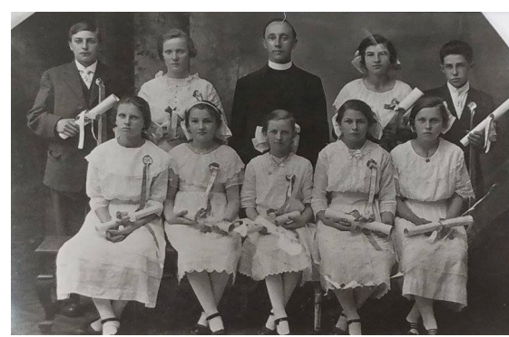
Class of 1916